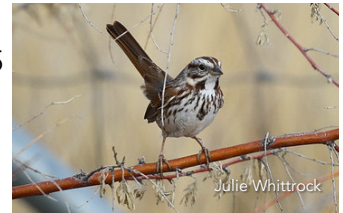
Song Sparrows are common at City Creek.

During 3 breeding season surveys at City Creek, we had 590 bird observations and detected 45 species. During 7 non-breeding season surveys, we had 682 bird observations and detected 57 species. We had a total species list of 66 species at City Creek in 2020.